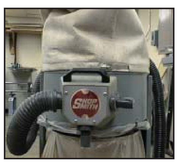
Figure 1 - This is the Shopsmith DC3300 with the New Handle RetroFit Kit attached to the 3-way inlet.